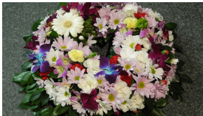
Northern Territory Board wreath