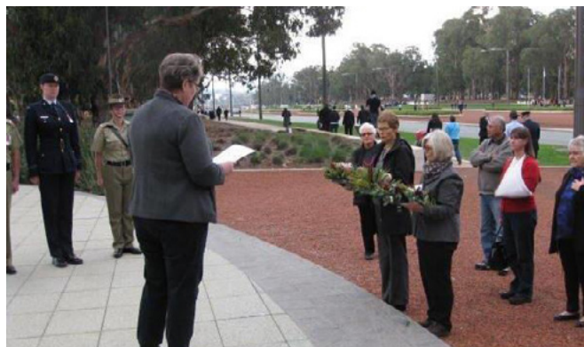
ACT wreath-laying ceremony

This ANZAC Day various members of the NMBA took the opportunity to commemorate those who fought and died for Australia and the nurses who tended the sick and wounded.